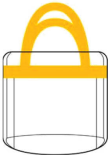
CLEAR TOTE PLASTIC, VINYL, OR PVC AND NO LARGER THAN 12" X 6" X 12"